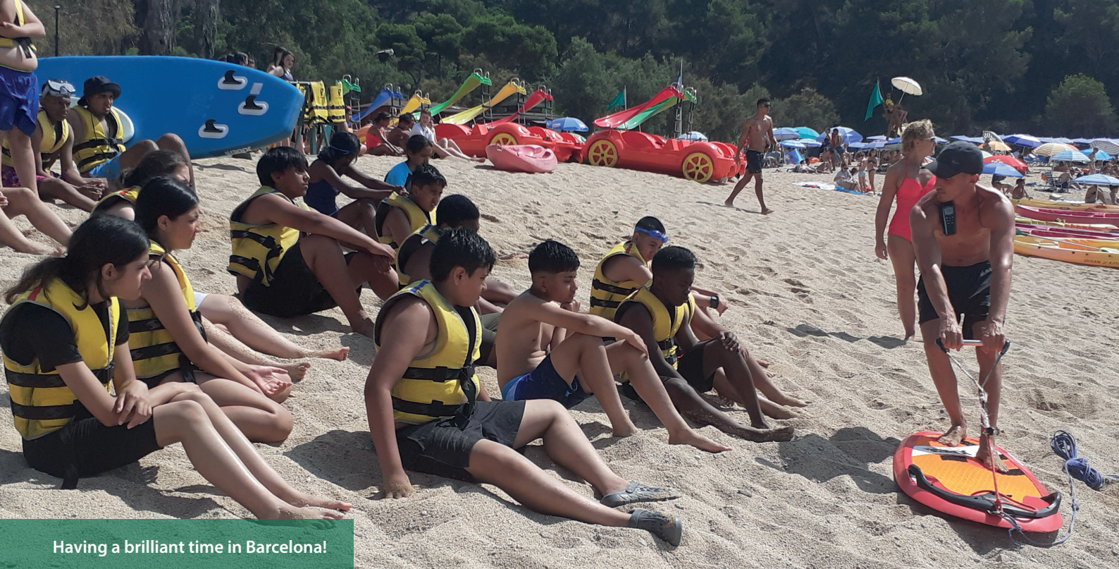
Having a brilliant time in Barcelona!