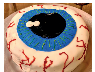
Some of the fabulous 'body part' cakes!