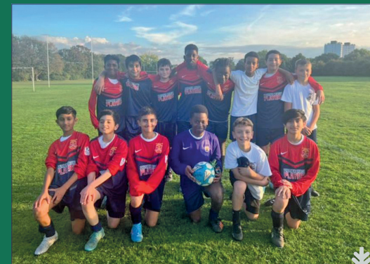
Year 8 Footballers all smiles after their cup win!