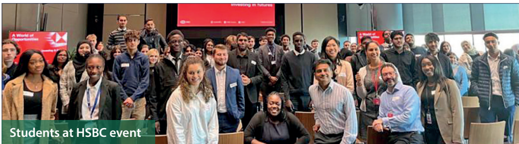
Students at HSBC event

On Friday 18th October 2022, I had the opportunity to attend HSBC at their Canary Wharf office to learn more about the HSBC Commercial Banking team. The day was very insightful and informative about different pathways into the bank.