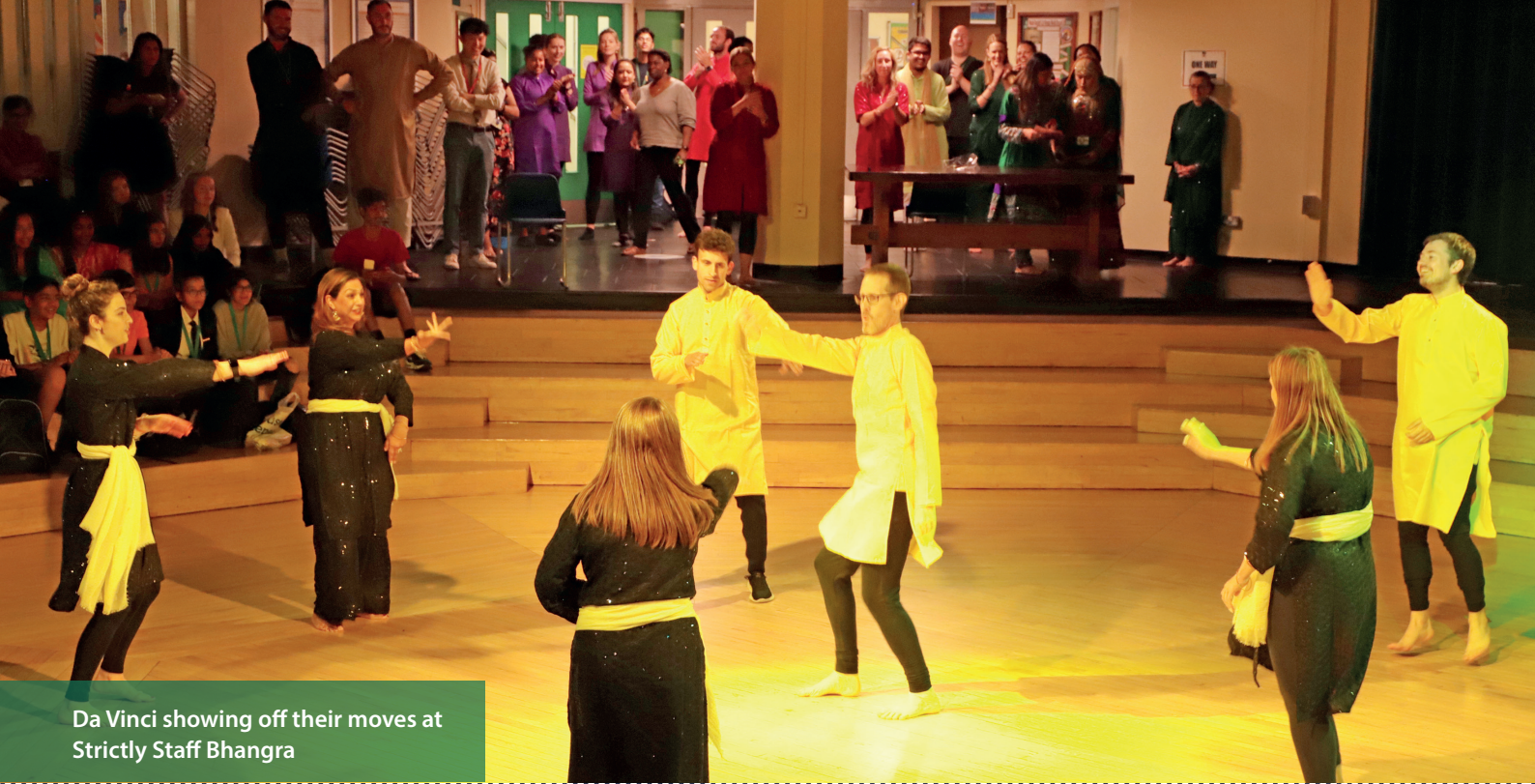
Da Vinci showing off their moves at Strictly Staff Bhangra