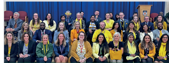
Staff raise awareness for World Mental Health Day

What a start to the new academic year! I am thankful to everyone who has warmly welcomed me into The Heathland. This Autumn Term has been extremely busy and we have some great highlights to share in this edition of the December Heathlander.