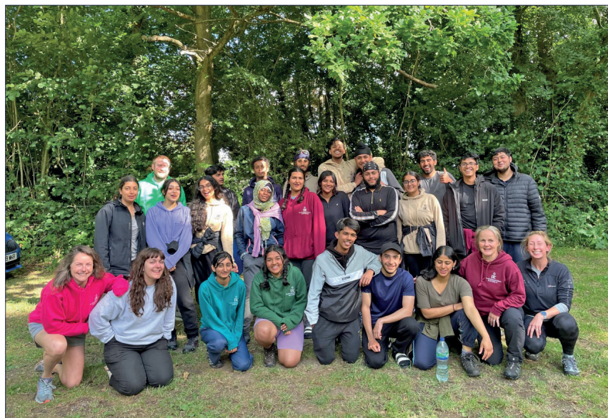
Year 12 Silver DofE students during their last expedition