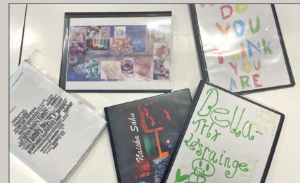
Who do you think you are' projects made by students in History Club.