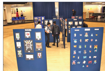
KS3 students' artwork on display in the Main Hall during Art Week.