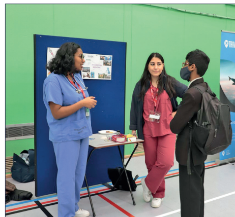
Year 9 students engage with healthcare professionals