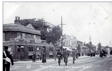
The Tram Terminus at Hounslow Heath