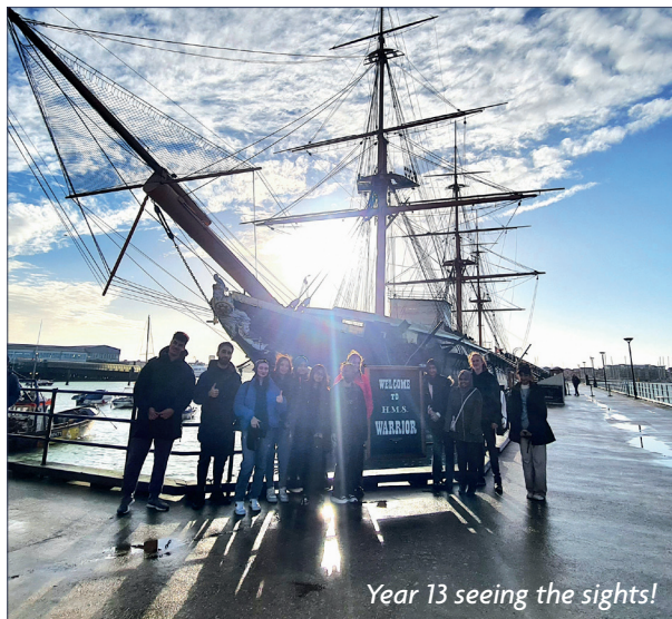
Year 13 seeing the sights!

The Year 13 History trip took us to Portsmouth Dockyard to witness the ships and equipment of the British Navy. The port was filled with various ships such as the HMS Victory and the HMS Warrior. The ships were intriguing in their layout and their history, how they came out victorious in battle yet having a shocking past full of gore. We also visited the museum which contained a number of ship figureheads, whilst ending the day off looking over at sea from the pier.