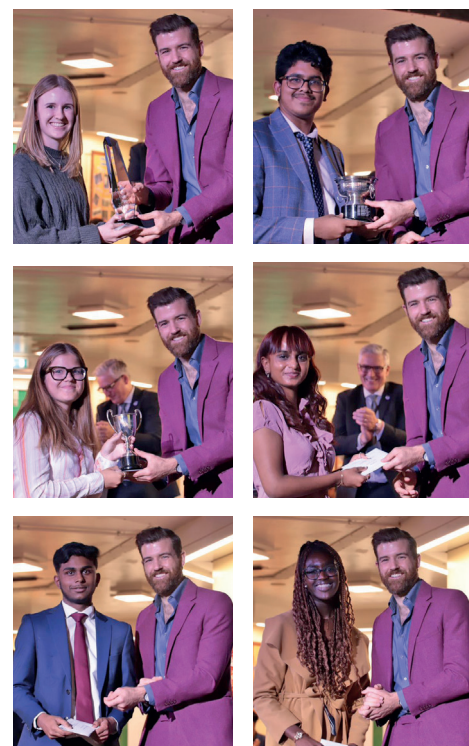
A selection of winners from the evening

We congratulate all students who completed their GCSEs and were awarded prizes, and look forward to celebrating the achievements of future students in years to come.