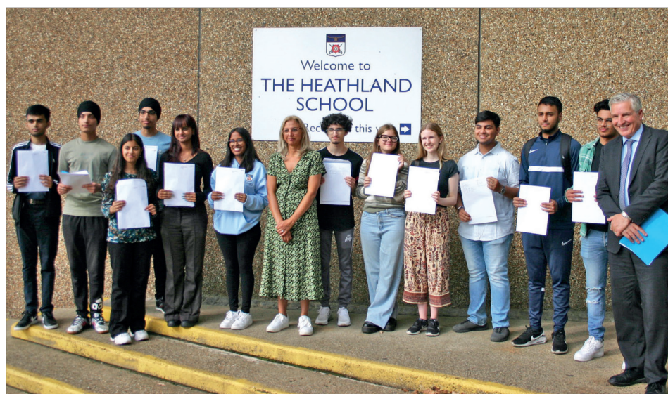
Excellent results from our Year 13 cohort

A huge congratulations to our Year 13 and 11 students for making it through a very tough and challenging few years. We are delighted with their results in their examinations. After a return to normal examinations, under challenging circumstances, we have attained exceptional GCSE results, which have surpassed 2019.