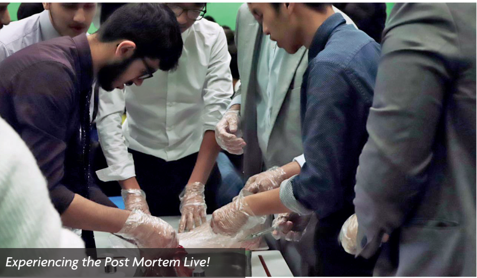
Experiencing the Post Mortem Live!

It was an immersive experience that used special effects and stimulation in order to recreate a realistic post-mortem experience. We were able to deepen our understanding on the human anatomy, a live post-mortem was conducted by professionals on a convincing human model containing animal's organs. We were then given the opportunity to carry out some hands on learning of our own