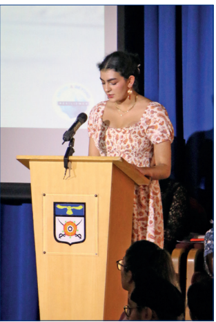
A selection of winners from the evening