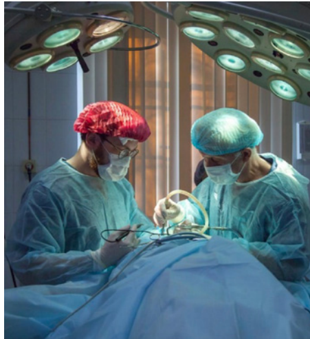
Economics in Medicine: A Healthy Collaboration