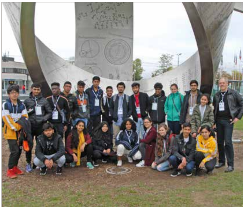
Year 12 Scientists and teachers at the CERN facility

Scientists in Year 12 took part in the annual trip to the CERN facility in Geneva this year, visiting the research institute and the Large Hadron Collider that operates within it.