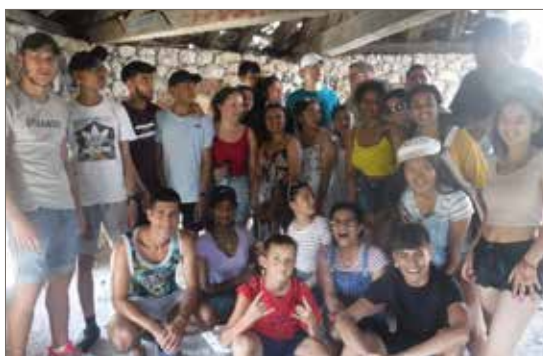
Team Bosnia 2019 with some of the residents of the orphanage